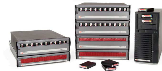
The InfiniVault Product Family

"We have really just started extensive transitions in our data center applications and processes, many of which will benefit by archiving old and new data to the ProStor InfiniVault," said a university AIX system administrator. "I'm very excited to find a data preservation system that can inexpensively grow with our data without any forward compatibility issues."